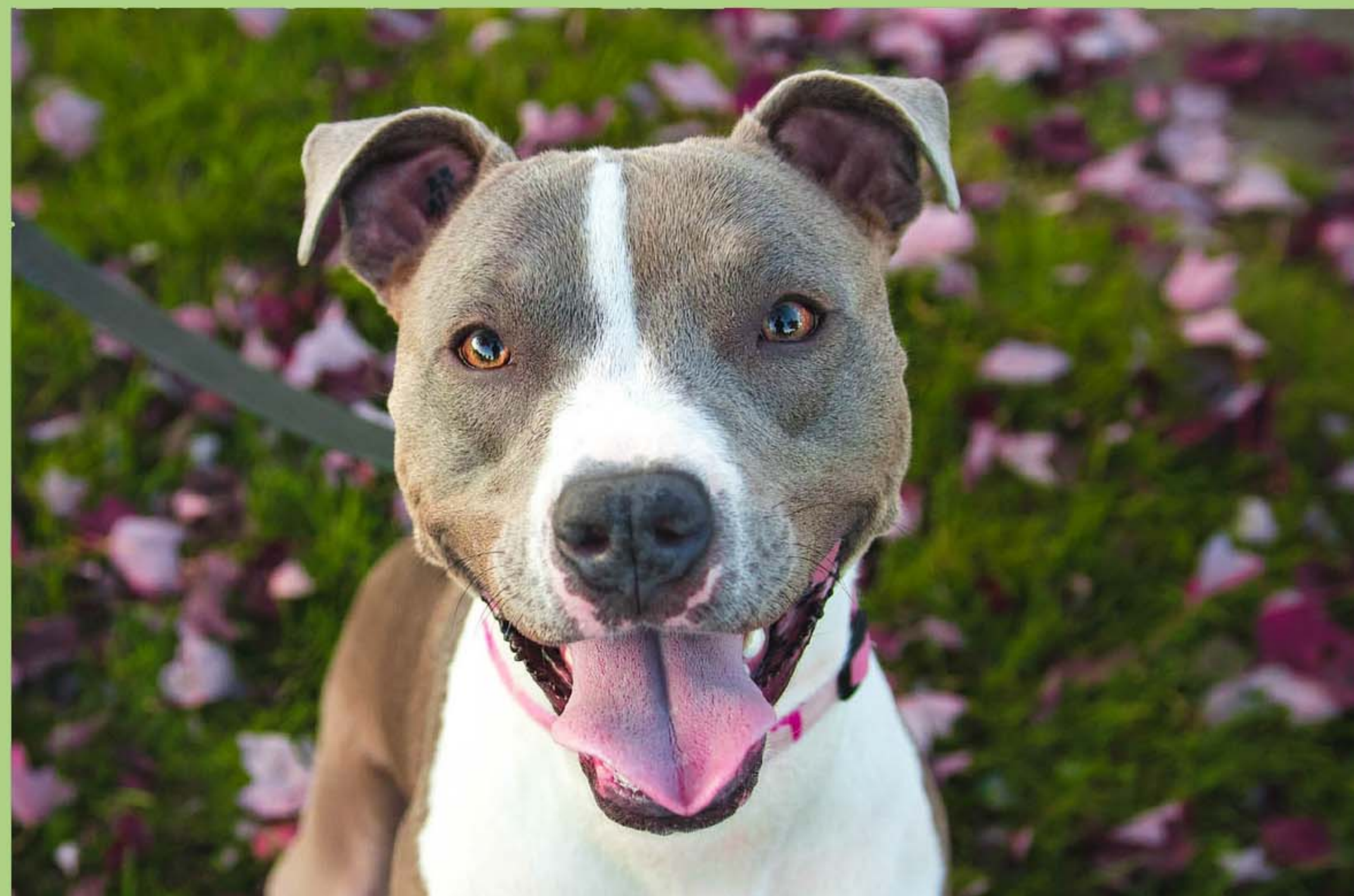
A relaxed and willing canine pupil

Television programmes aimed at entertaining dog lovers often unwittingly help promote these scientifically discredited and unethical techniques. This is because programme producers may not know about contemporary welfare driven approaches or where to find the appropriately qualified people to present them, there will also be a reluctance to change a formula for a programme that is